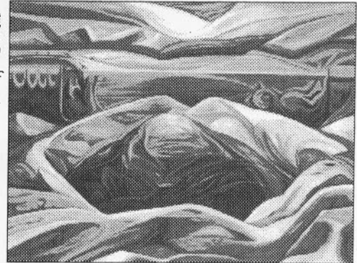
Pool of Water oil/canvas 18"x24" 1997