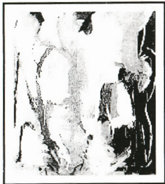
The Spirit of St. Therese, mixed media 1998