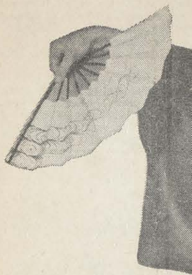
Old castle dance is rehearse