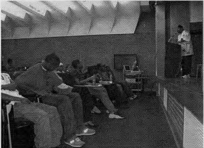
Real Young Men's First Annual Boys' Conference

A typical life skills session would begin in an opening circle where the TLC staff and youth made announcements and joined hands in prayer. The TLC youth would then be divided by gender into our life skills session in which Empower staff had to be prepared to discuss whatever issues were on their minds that particular day. To conclude our sessions, everyone would gather in the closing circle for acknowledgements, prayer and the much