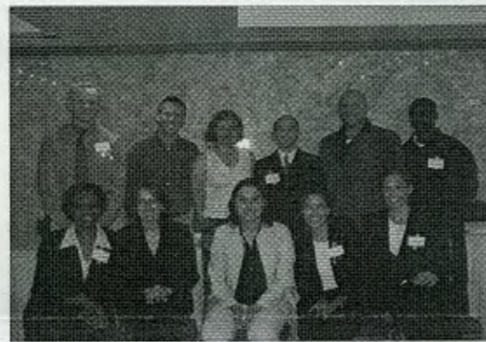
The staff of Empower and Saturday Night Live's Tina Fey at the first annual WomenSpeak Symposium

I've worked with thousands of girls and they are no different than how I was as a teen; the only thing that has changed is that girls today are stronger, smarter and bolder (Girls, Inc.), which on the large scale, is a good thing. However, I also believe that with creating stronger, smarter, bolder girls, we've failed in creating girls with compassion, girls with sincere niceness and girls who aren't out to be number one by any means necessary.