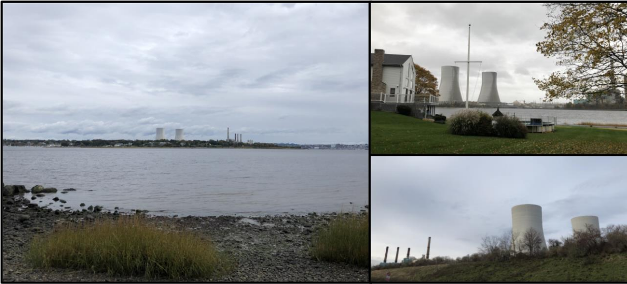
Figure 1: View of the Brayton Point Power Plant L to R: looking east from Bristol, RI, looking east from Touisset Point, RI; and looking west from Somerset, MA.