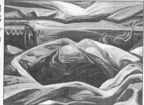
Pool of Water oil/canvas 18"x24" 1997