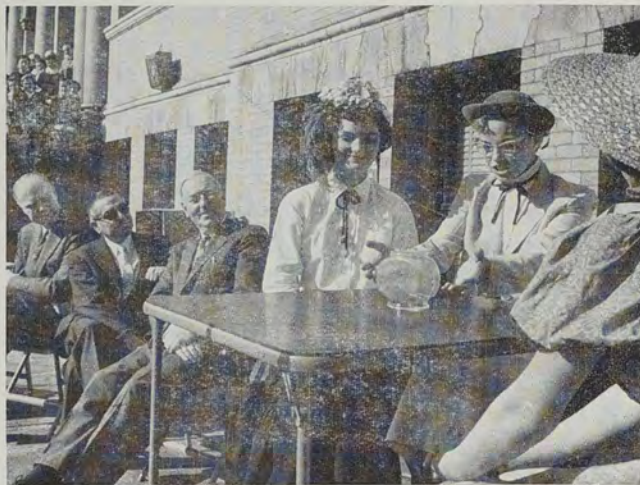
President, Senator, and Vice-President view freshman skit.