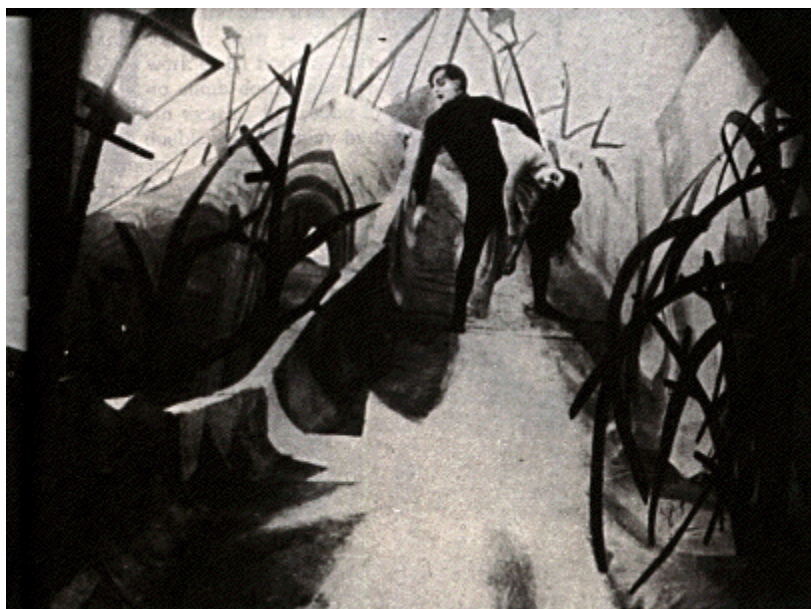
Fig. 1 – Expressionist mise-en-scene, from The Cabinet of Dr. Caligari