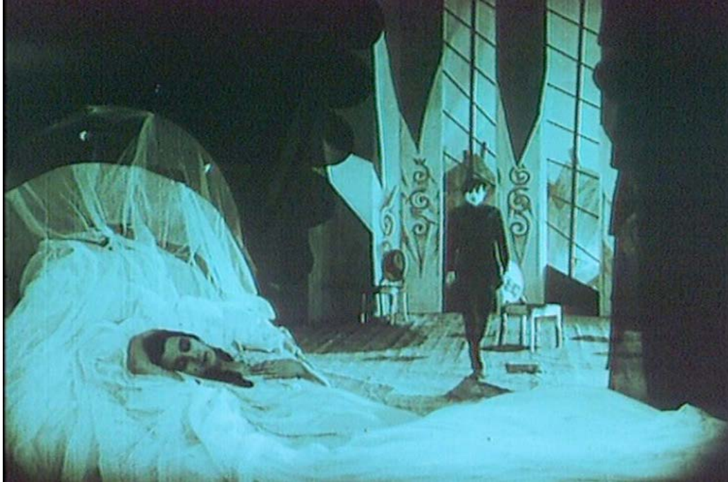
Fig. 8 – Jane's attack, The Cabinet of Dr. Caligari