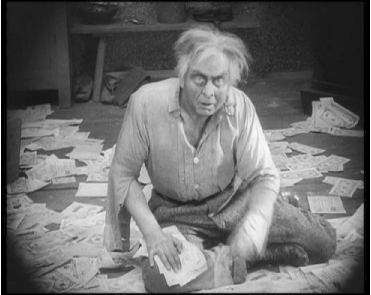
Fig. 14 – Mabuse's defeat, Dr. Mabuse, the Gambler