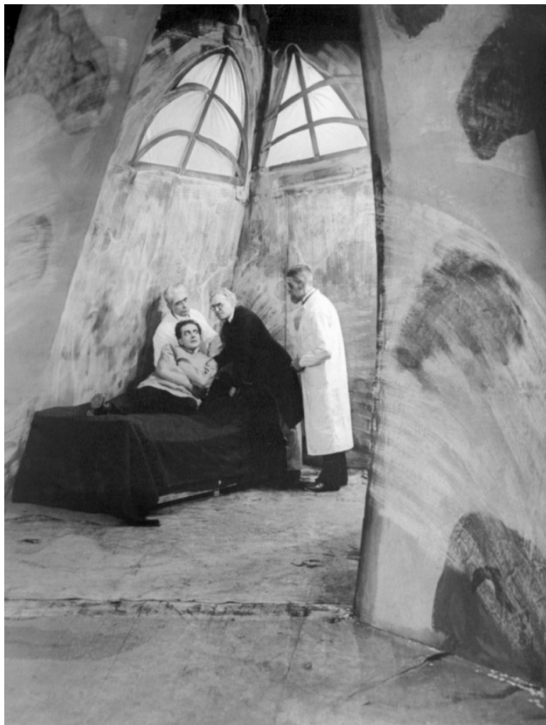
Fig. 7 – Asylum, The Cabinet of Dr. Caligari