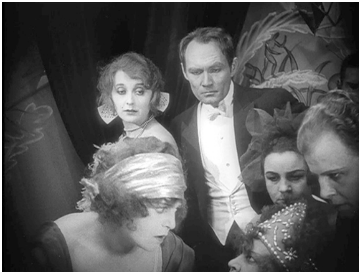
Fig. 13 – Countess Told, Dr. Mabuse, the Gambler