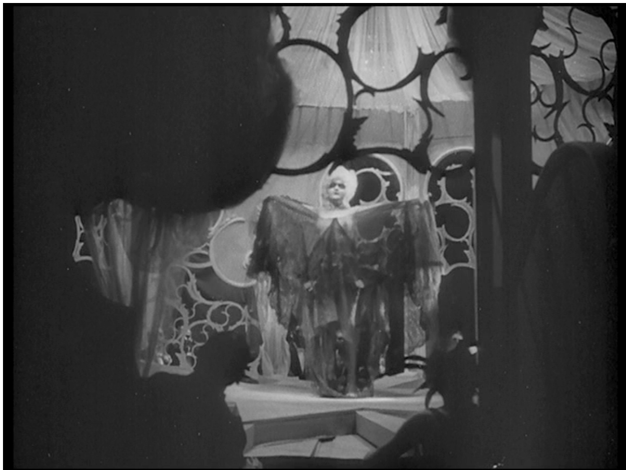
Fig. 10 – Petit Casino, Dr. Mabuse, the Gambler