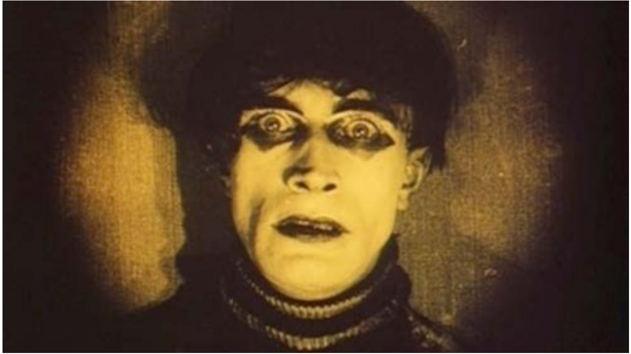
Fig. 5 – Cesare, The Cabinet of Dr. Caligari