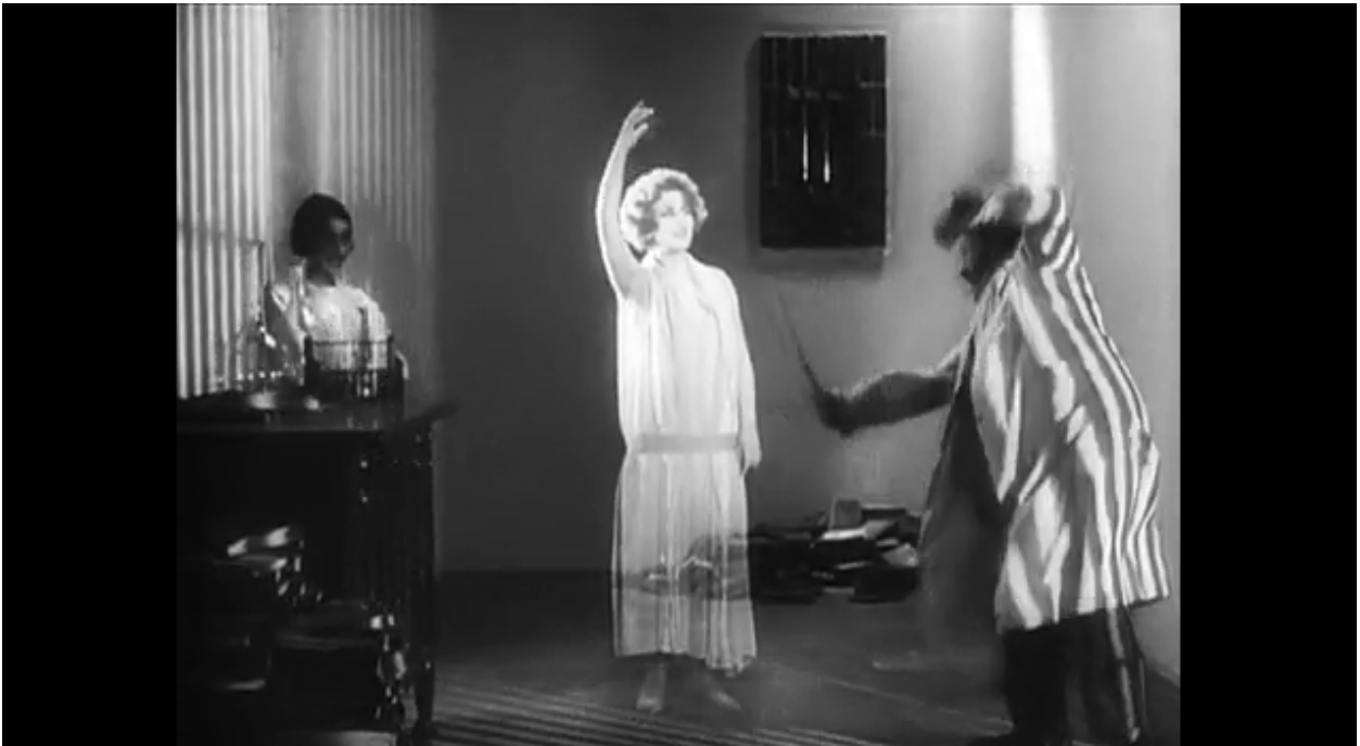
Fig. 4 – Martin stabs wife, Secrets of a Soul