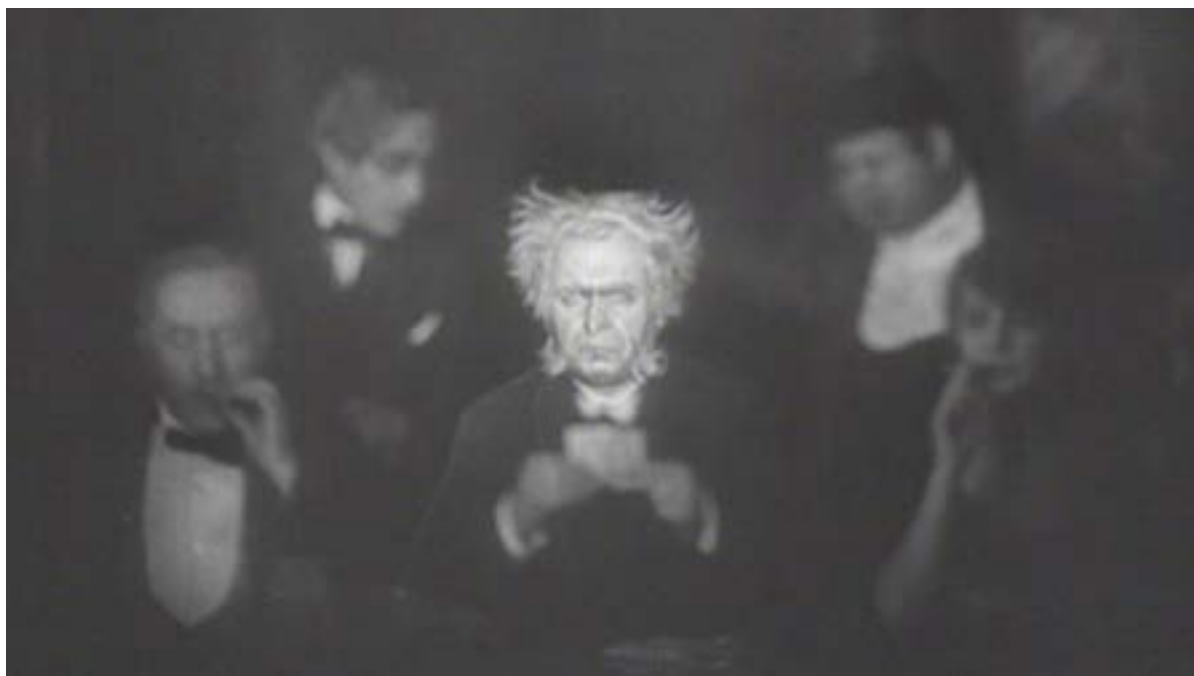
Fig. 12 – Displacement (staged screen right), Dr. Mabuse, the Gambler