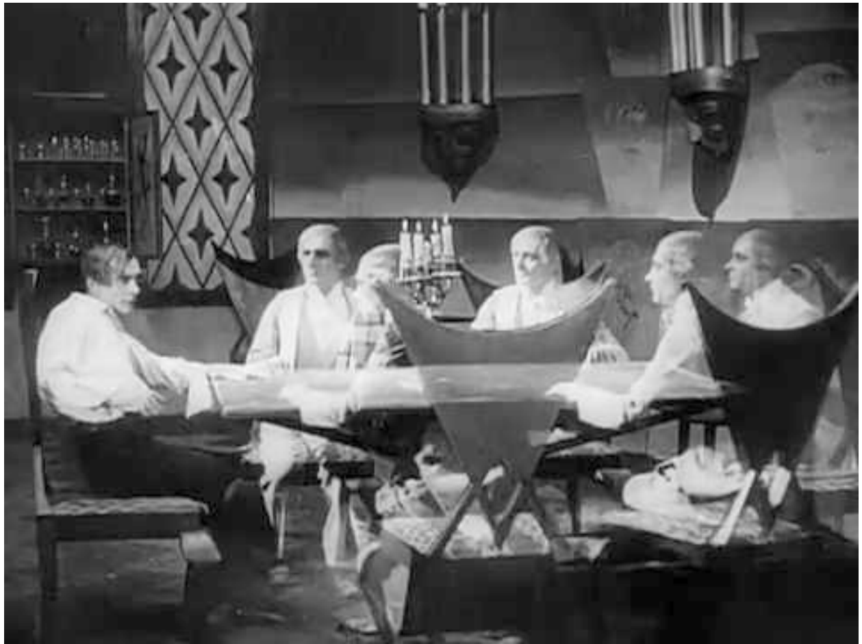
Fig. 11 – Fever Dream, Dr. Mabuse, the Gambler