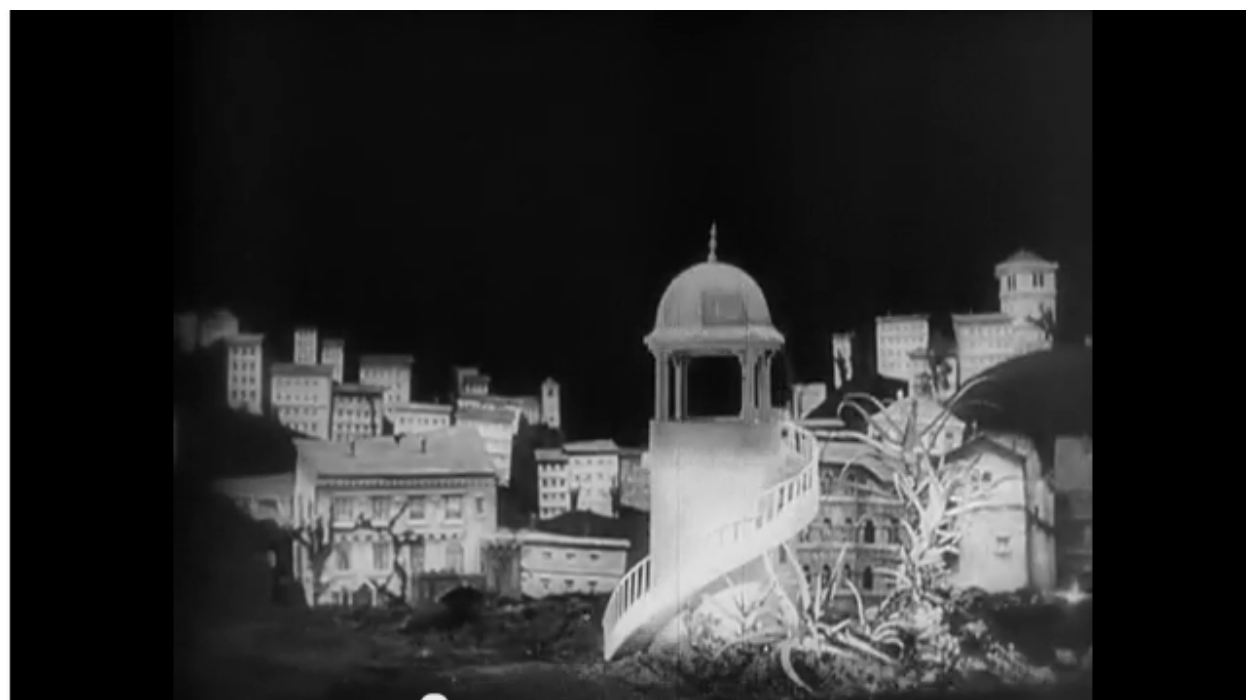
Fig. 2 – Tower in Secrets of a Soul