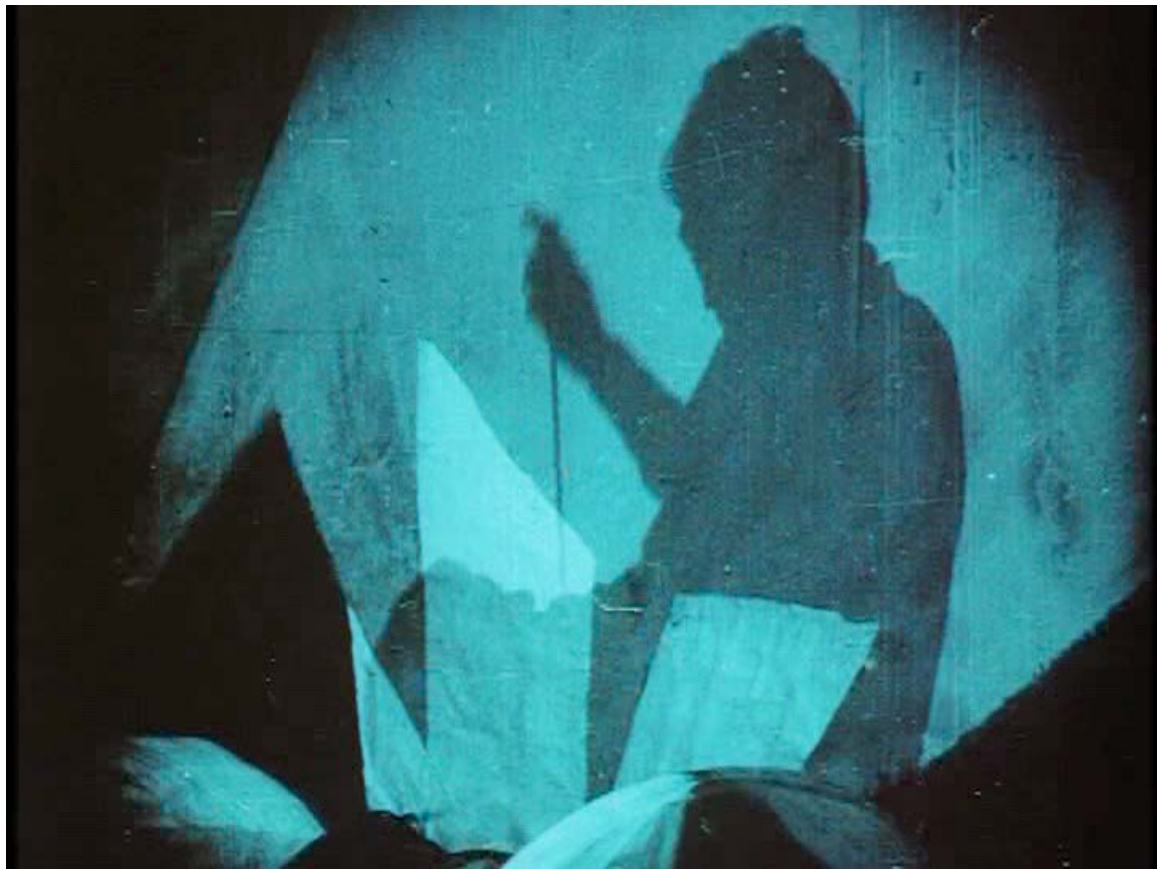
Fig. 6 – Alan's Attack, The Cabinet of Dr. Caligari