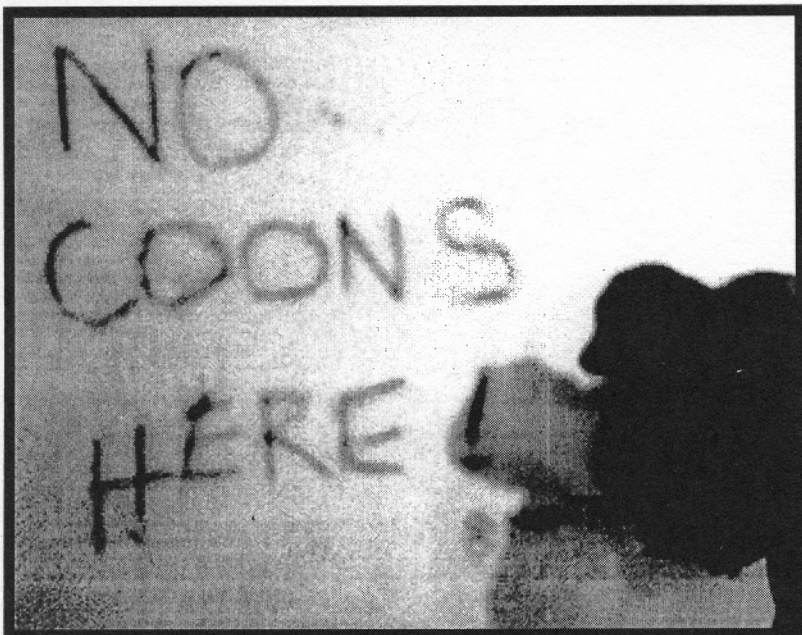
"No Coons Here", Lip Stick applied to wall, Performed at Real Art Ways, 1995